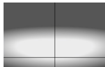
Asymmetrical flat beam