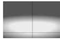
Asymmetrical flat beam

Use Lighting points for roads and car parks.